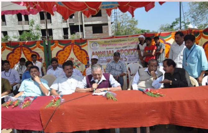
Inaugural Ceremony of Annual Sports Week on January 19, 2013.