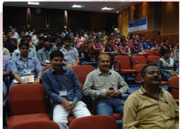
A still from Industrial Automation Workshop