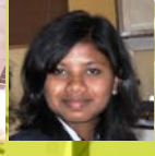
Forbilty K 3rd (71.6 %)