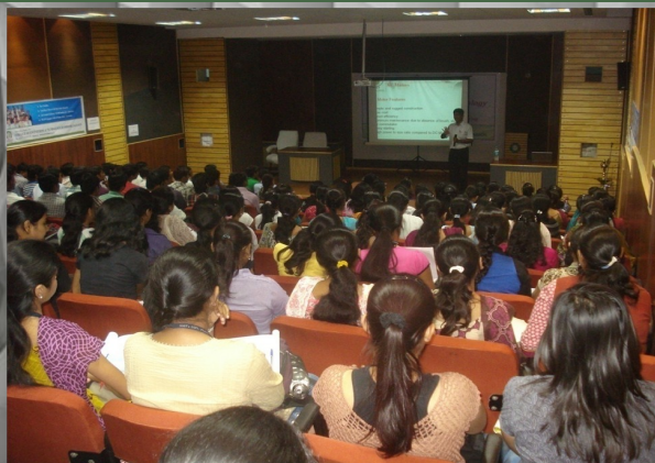
Entrepreneurship Awareness Camp