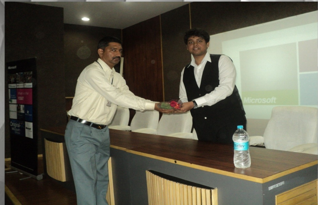
Seminar on Microsoft Technologies.